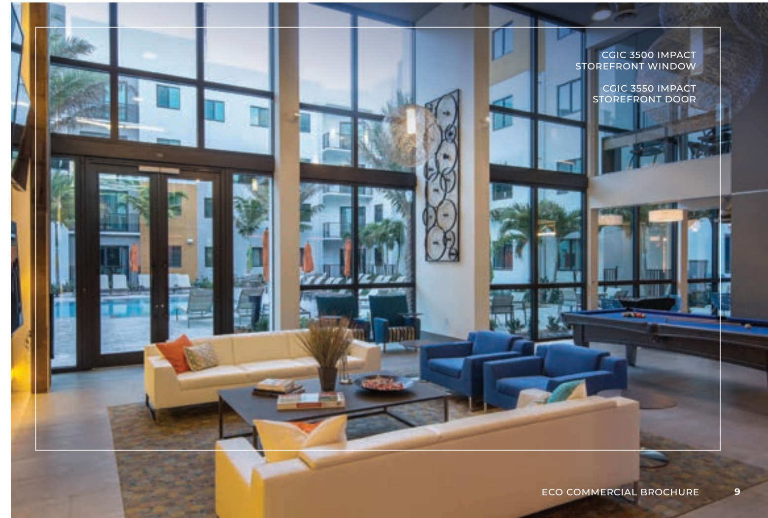
CGIC 3500 IMPACT STOREFRONT WINDOW