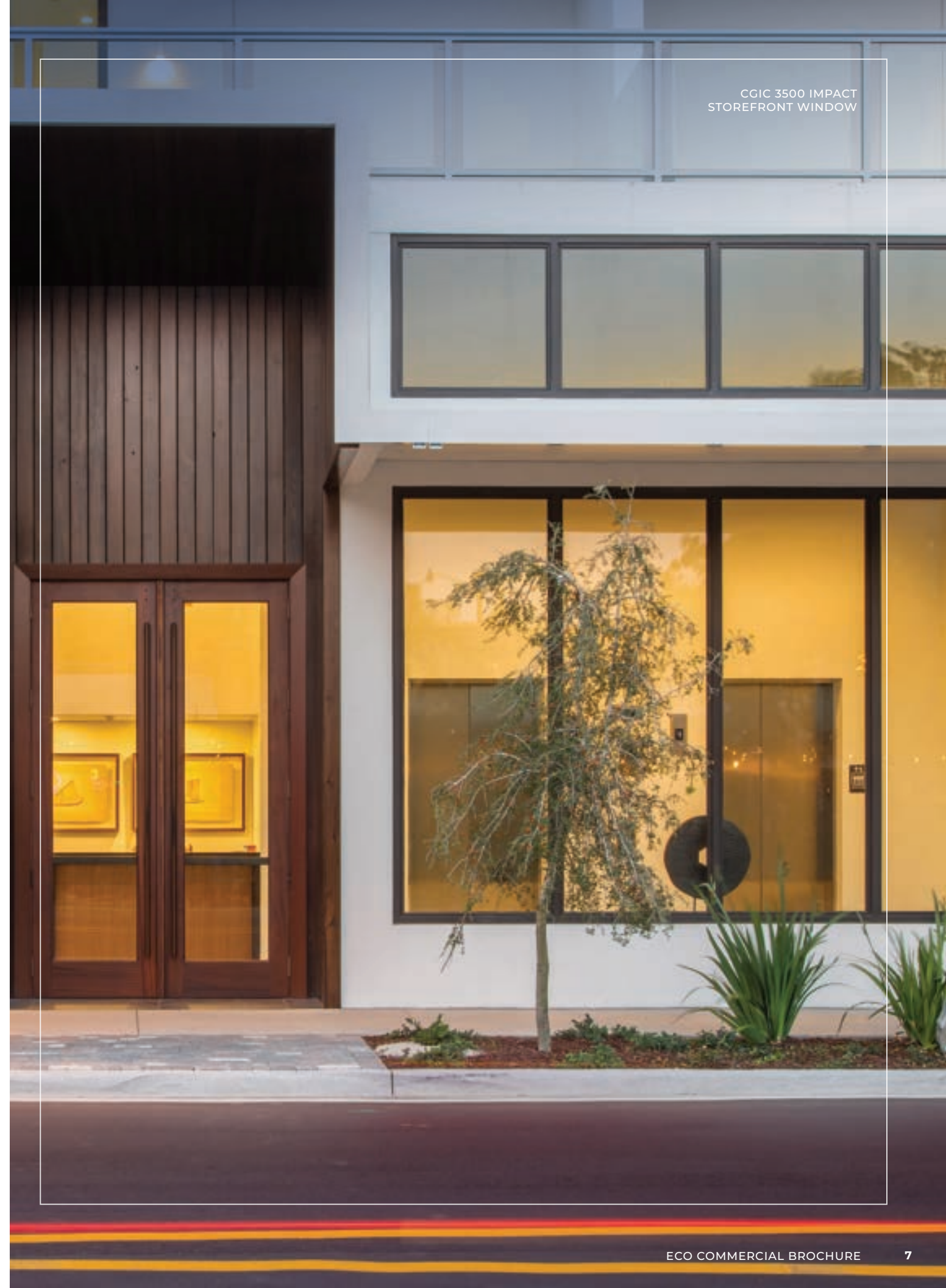
CGIC 3500 IMPACT STOREFRONT WINDOW