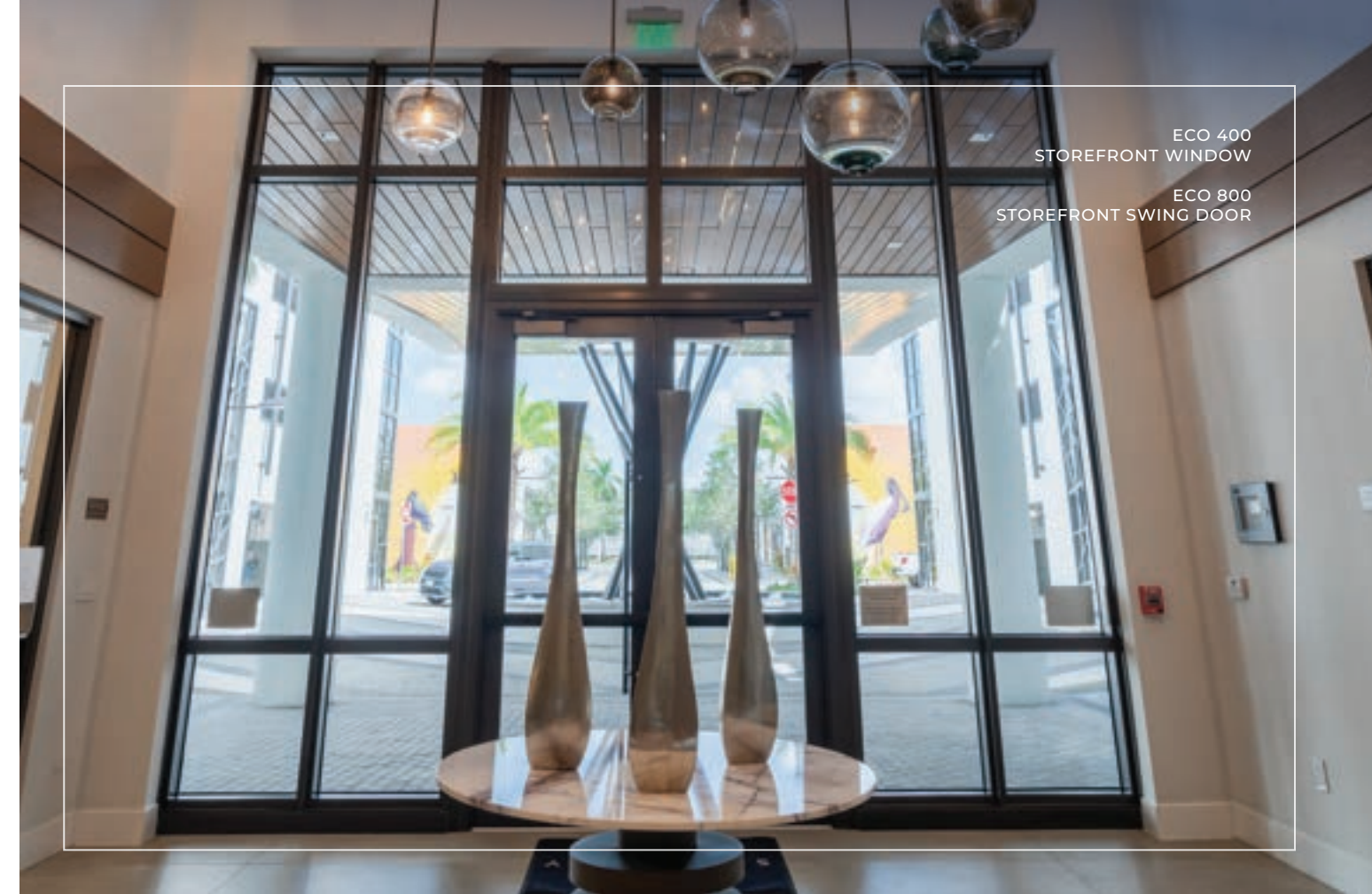
ECO 400 STOREFRONT WINDOW ECO 800 STOREFRONT SWING DOOR