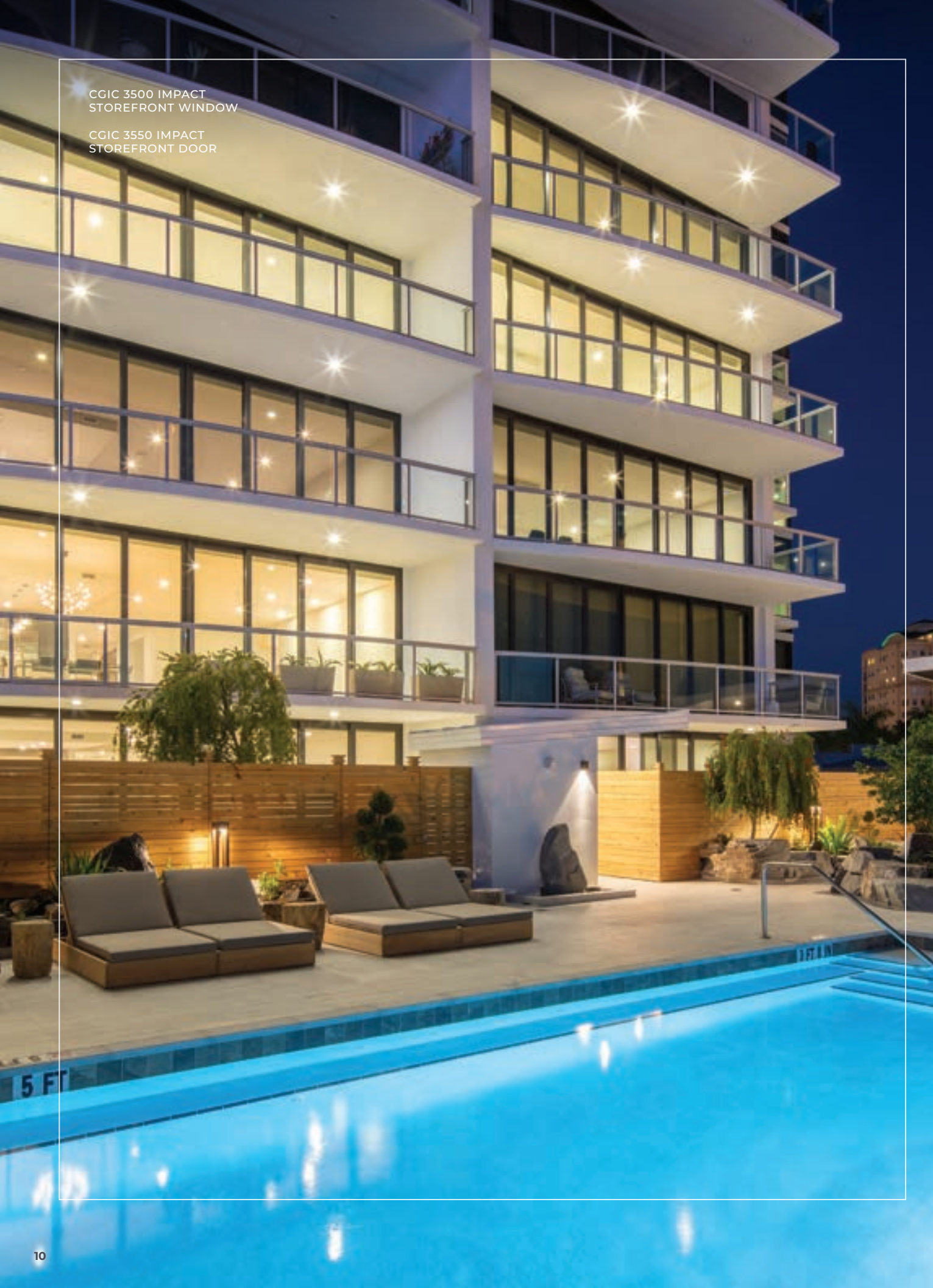
CGIC 3500 IMPACT STOREFRONT WINDOW