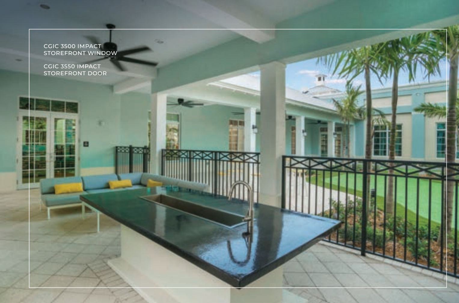
CGIC 3500 IMPACT STOREFRONT WINDOW